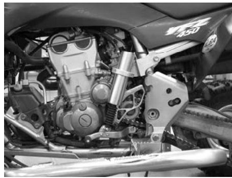
2005 Yamaha YFZ450