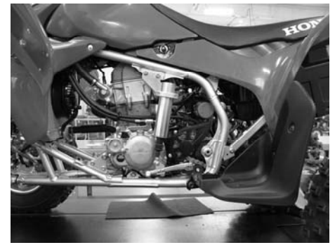
2008 Honda TRX450R

Dear Valued Customer, Pingel Enterprise, Inc. would like to take this opportunity to thank you for purchasing one of our Electric Speed Shifter Kits. We would also like to know what you think of the product and how your installation went. Your assistance can help us overcome any technical issues that other installers may experience. You can reach us toll free at 1-888-474-6435 or email us at info@pingelonline.com . We are also requesting photos of your installation. Your photos may be selected for publication in the Pingel catalog or at www.pingelonline.com . Photos may be submitted by emailing them to info@pingelonline.com . When submitting a photo, please include the motorcycle model and year. Thank you again for your purchase!