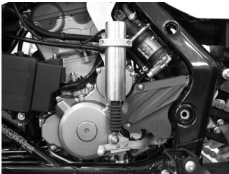
2007 Suzuki LTR450